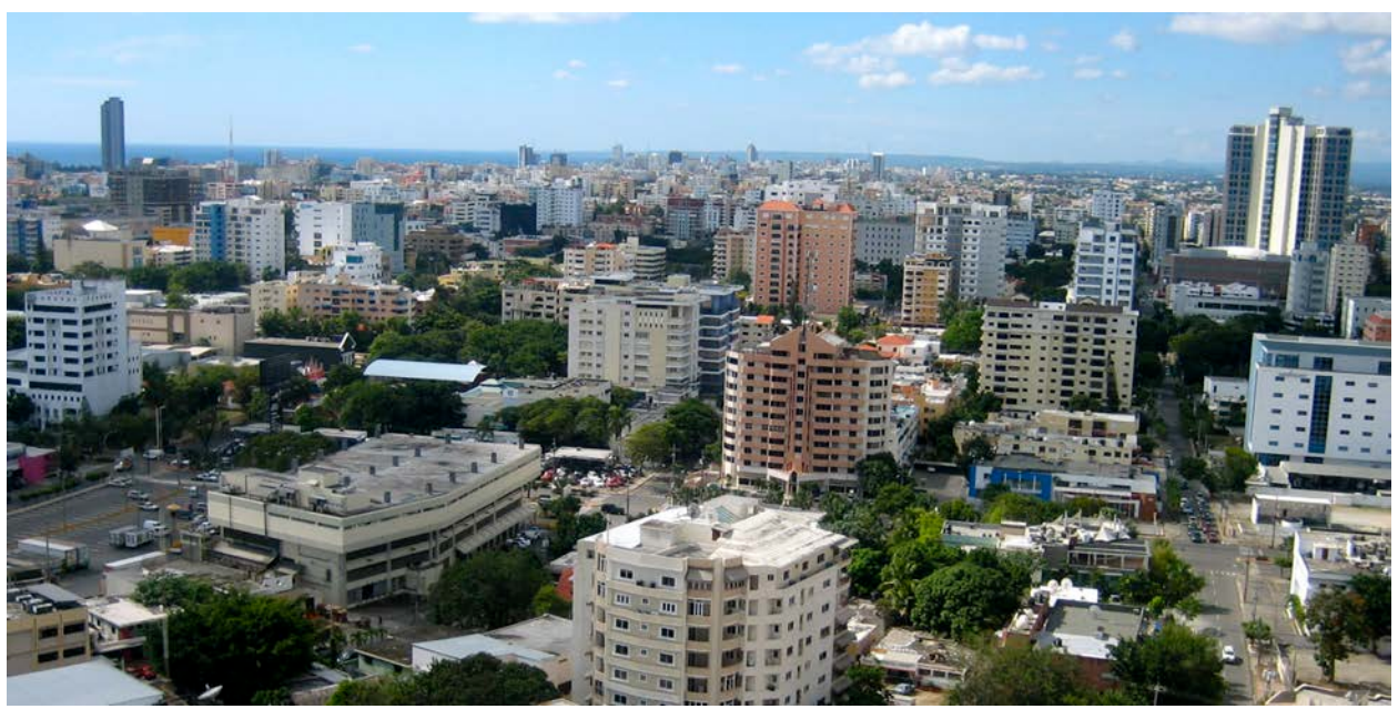
Santo Domingo, Dominican Republic

<u>Integration</u>: To date, there is no clear model that would allow online and offline participation to function well together. There is great potential to better assess how information, oversight, face-to-face deliberation, and online deliberation could be combined to produce new PB formats.