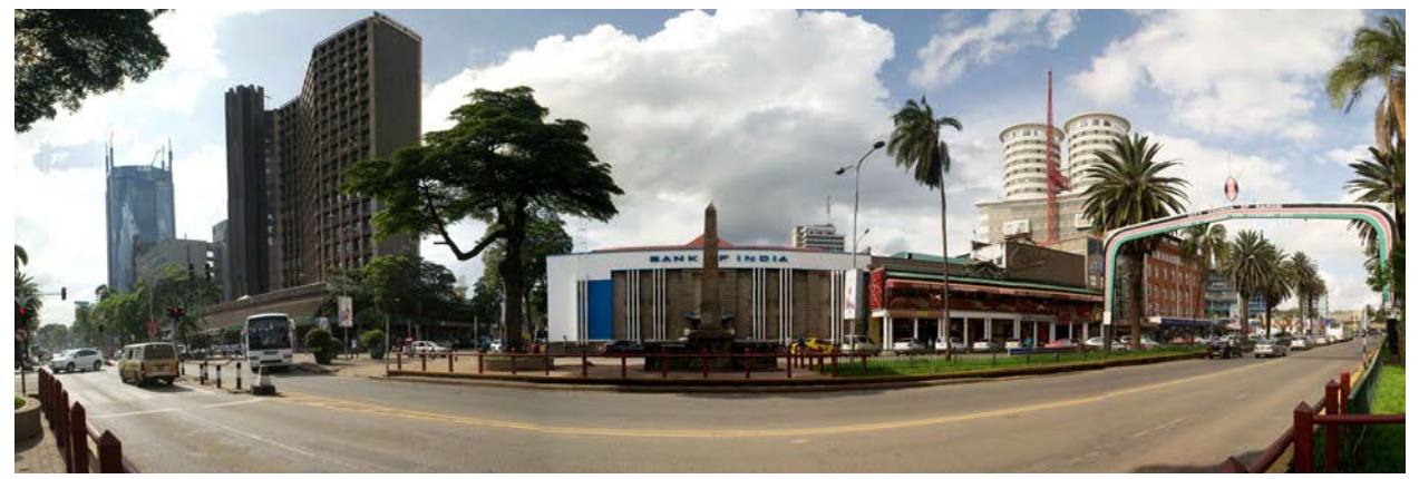
Kenyatta Avenue. Nairobi, Kenya

The fifth section narrows the analysis to focus explicitly on citizen participation and inclusion. The sixth section focuses on the role of technology in PB. The seventh section illuminates issues related to advocacy organizations, donors, and 'PB Champions.' The eighth section focuses on research, with an emphasis on conflicting findings as well as gaps in our knowledge and research opportunities in the near future.