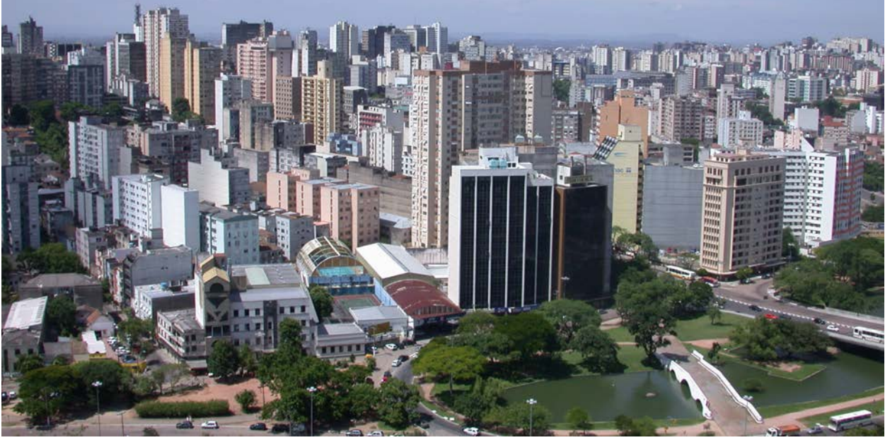
Skyline. Porto Alegre, Brazil

<u>PB in competitive authoritarian contexts</u>: PB has been used in competitive authoritarian environments, such as Russia, Uganda, Venezuela, and uncompetitive authoritarian environments, such as China and Cuba. There is an opportunity to emphasize PB's democratic roots and to improve governance if these countries allow an international organization to work directly with civil society activists. The Ugandan experience is noteworthy due to the real lack of citizen power in the process; it as a consultative process, at best. The Mozambique case is interesting because PB appears to be faring better in places where the political opposition is strongest. In Tanzania, opposition political parties and CSOs are considering implementing a PB-type program in cities held by the political opposition.