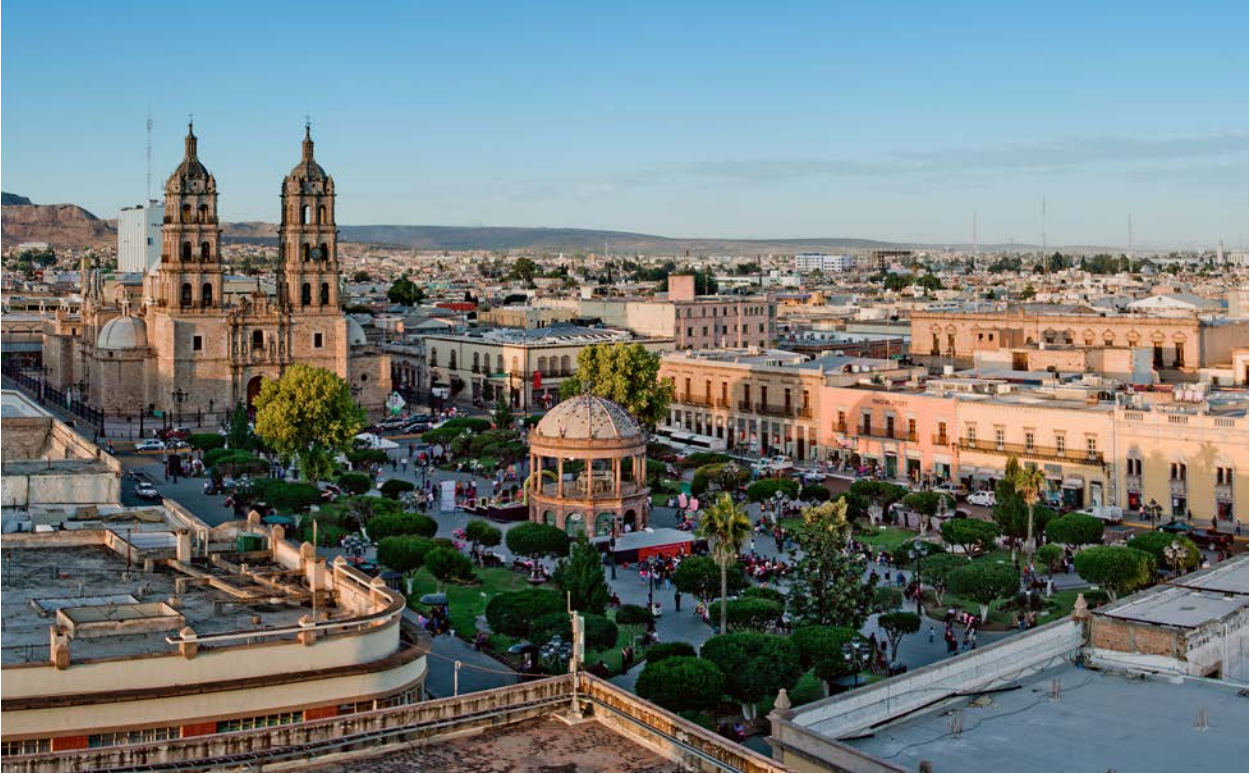
Plaza de Armas. Durango, Mexico

Oversight: PB programs often assert that they have extensive oversight practices, but the literature suggests that oversight is actually quite limited. A key idea behind the original PB programs was to allow citizens to exercise oversight over larger portions of the budget. However, there is little evidence that citizens do this. Oversight tends to be very project focused, when it exists, and doesn't necessarily expand to the broader budget. This problem is related to the costs of technology discussed above as well as to several additional issues, such as the lack of information about project implementation, and the highly technical nature of overseeing most projects. It is possible that citizens are learning the necessary skills to help them exercise oversight over the entire budget, but there is little evidence that this is being done in a widespread way.