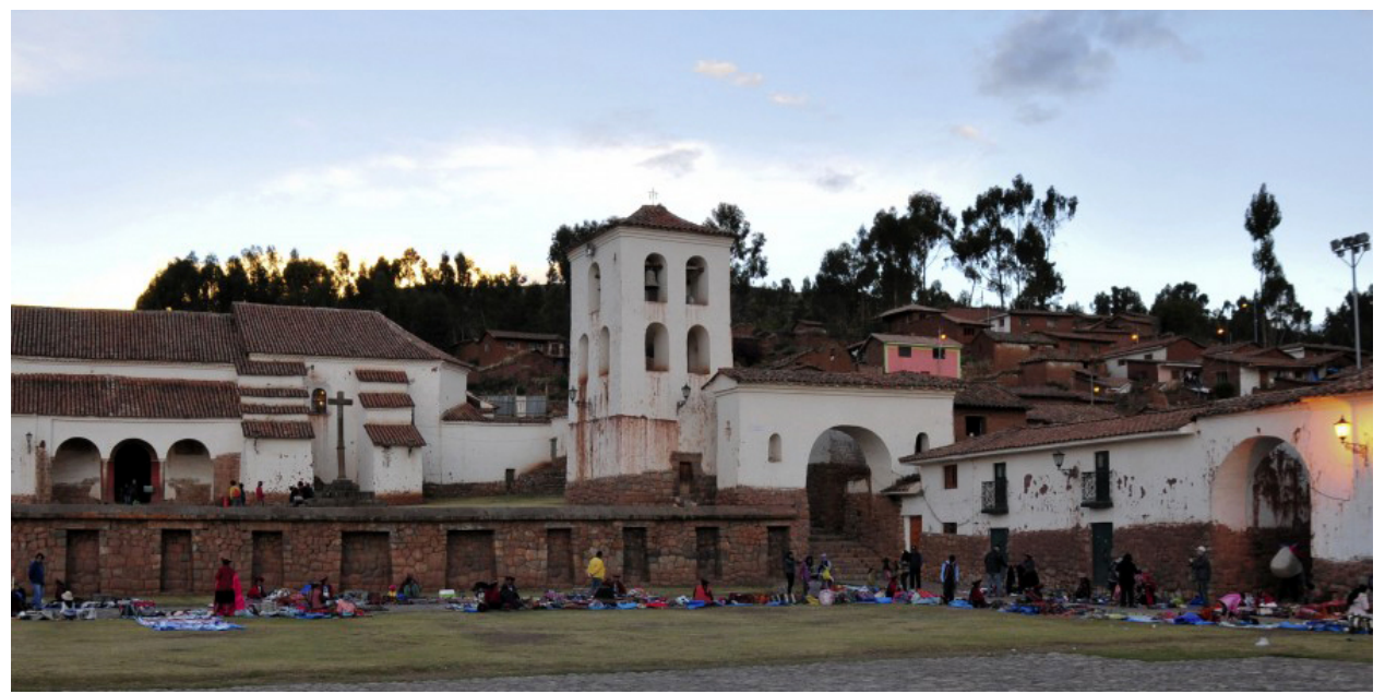
Mercado de Artesanias, Chinchero District, Cusco, Peru

All of the efforts above target cost-effectiveness for the government. One area that needs much more attention is the issue of cost for participants. Participant costs can be thought of in terms of both financial and opportunity costs. To the best of our knowledge, participants are almost never reimbursed for their daily expenses or offered an honorarium for the time spent developing and voting on proposals. This can be mitigated by online or cellphone voting in many developed world contexts. In developing countries, however, participants' costs, measured in terms of time and travel, can be extremely high. One World Bank (2011) study estimates that in Peru, a rural worker who needs to travel to a regional capital to participate may spend up to the equivalent of one months' minimum-wage salary. Costs are lower for urban participants, but the statistic highlights the need to take into account participant costs when thinking about PB.