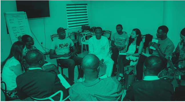
Abuja workshop participants share stories on how they have used data to fight corruption.